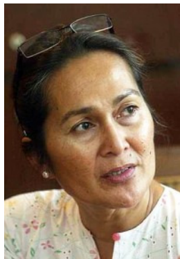
Film director Yasmin Ahmad

PETALING JAYA: Internationally-acclaimed movie director Yasmin Ahmad, also renowned for her advertisements capturing the multiracial essence of Malaysia, suffered a stroke while attending a meeting at Sri Pentas here Thursday.