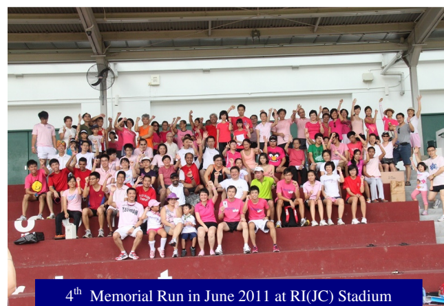
4 th Memorial Run in June 2011 at RI(JC) Stadium